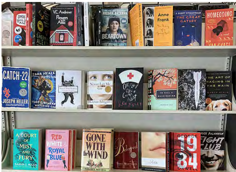
◀ Some banned books on display at Bookstore1