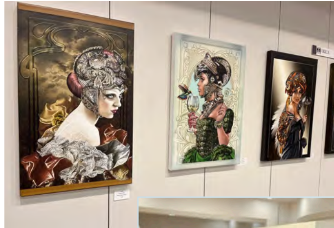
◀ A few of Liz's "Fierce and Fabulous" digital paintings